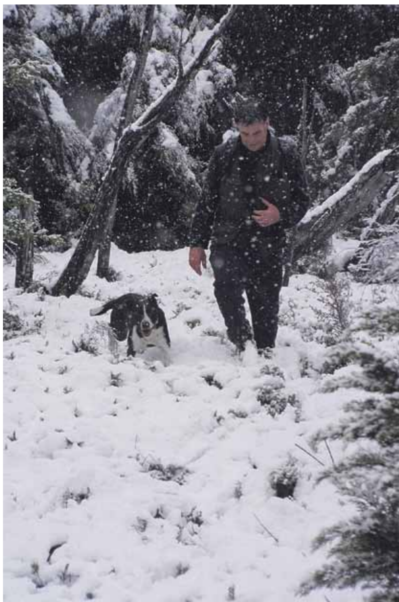
LandSAR volunteers and their dogs must be prepared to work in all conditions