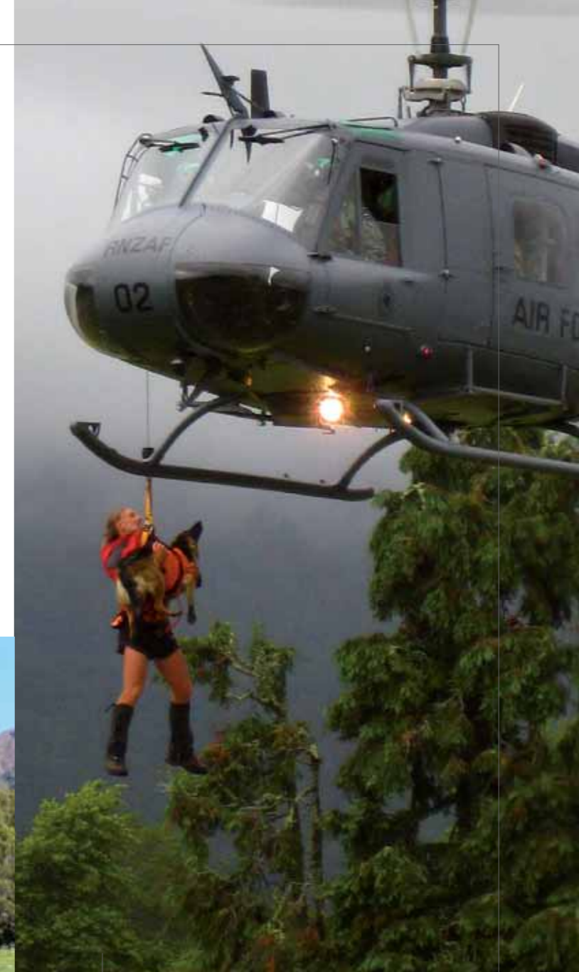
Above: Life as an operational search dog is nothing if not adventurous; Left: Nothing fazes this rescue hound

He or she must be fit enough to handle rough terrain and adverse conditions, and needs to be aware of and ready to face any fears that may occur in the wilderness. The dog handler needs to act without panicking in a crisis and has to accept a degree of risk to themselves and their dog when entering into a search and rescue situation.