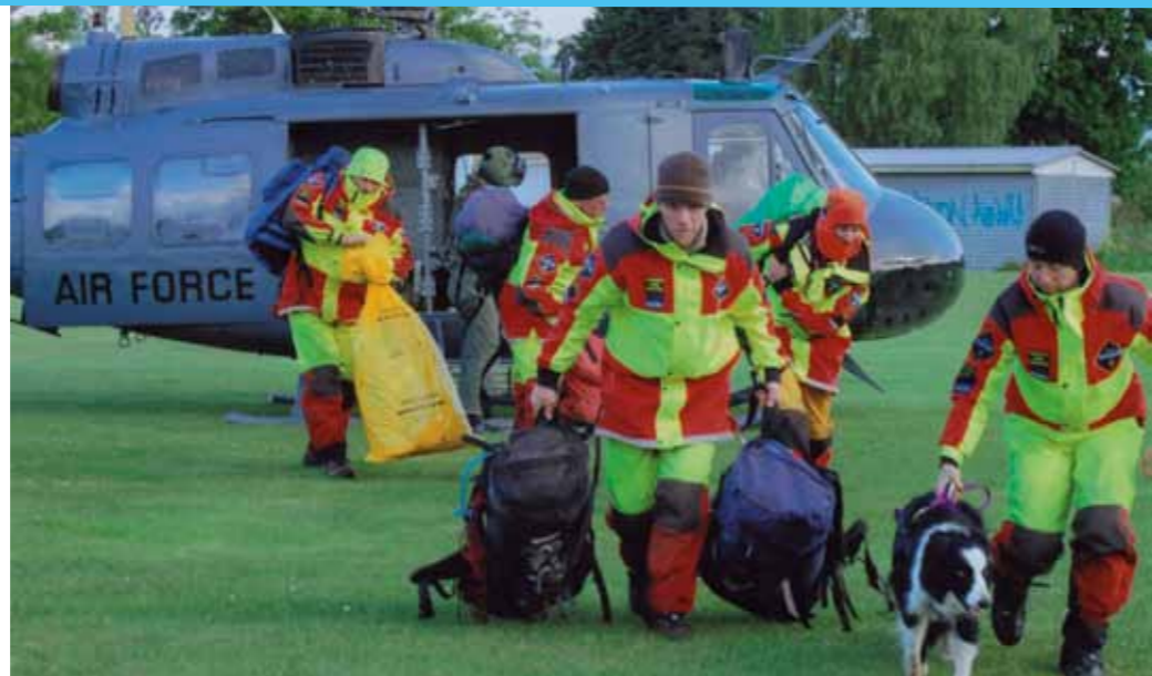
Above: A handler and his dog deep in the New Zealand wilderness; Right: Search and Rescue personnel unload from a helicopter in preparation for another operation; Far right: LandSAR dogs are go-anywhere dogs